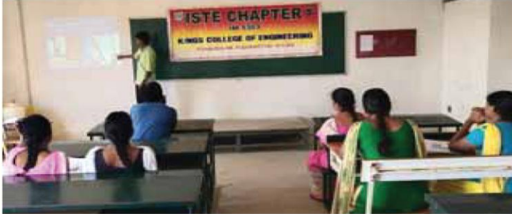
Student actively presenting the papers during the paper presentation.