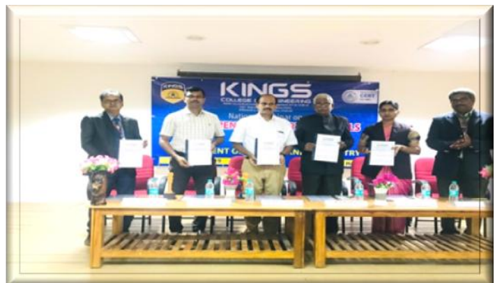
Release of Conference Proceedings