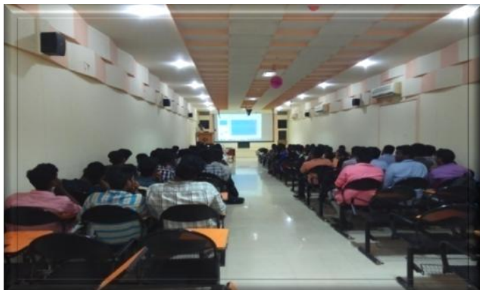
Awareness Lecture to our Students