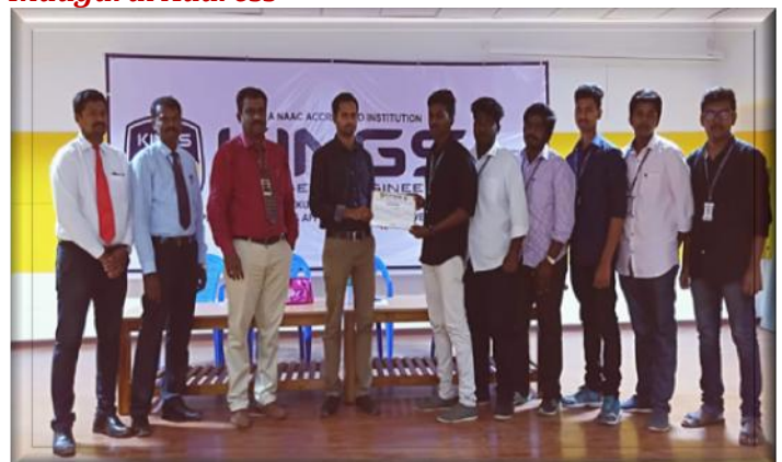
Certificate distribution - Workshop on “Advanced Industrial Robotics and Automation”