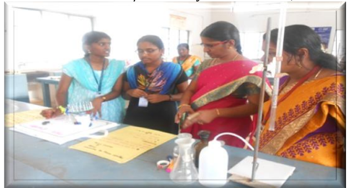
Students Exhibiting their Projects at Project Expo