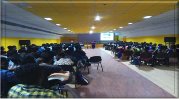
Participants are listening a Lecture