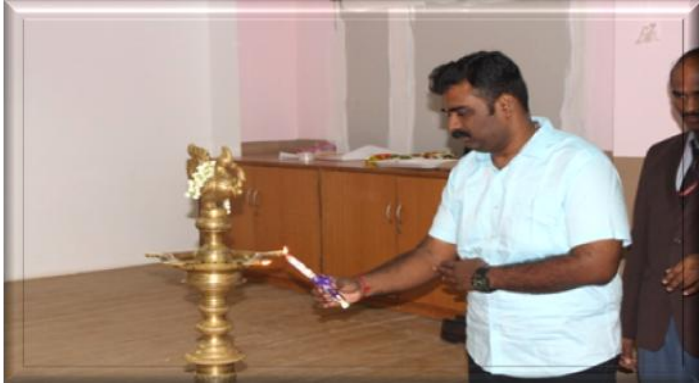
Lighting of Holy lamp by Chief guest