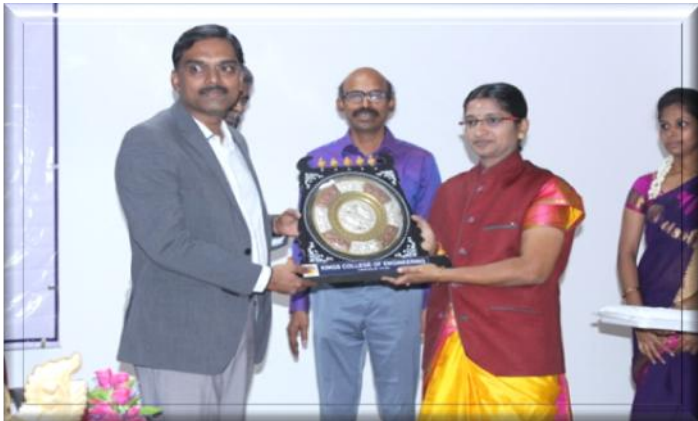
Honouring the Chief Guest