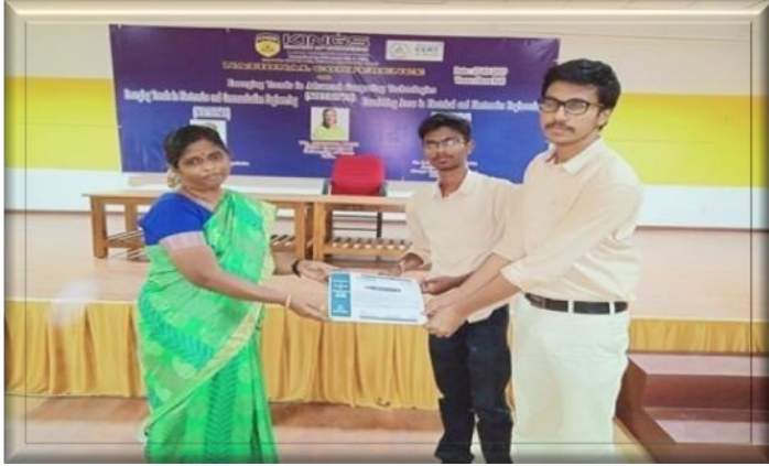
Distribution of Certificates NCETACT'19 participants