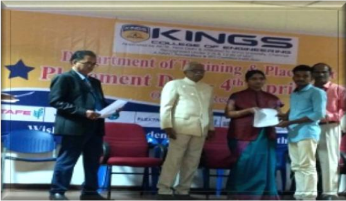
Distribution of Offer letters to the placed students.