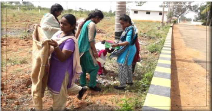
Students are in Field Work