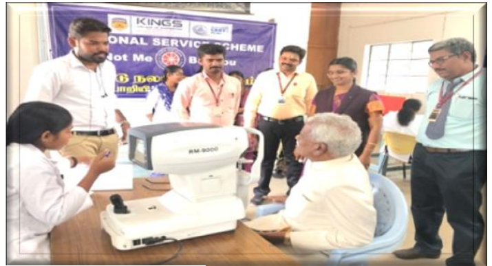
Secretary at Eye Camp