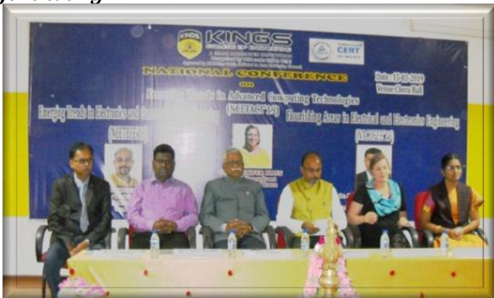
Dignitaries on the Dias – NCON'19