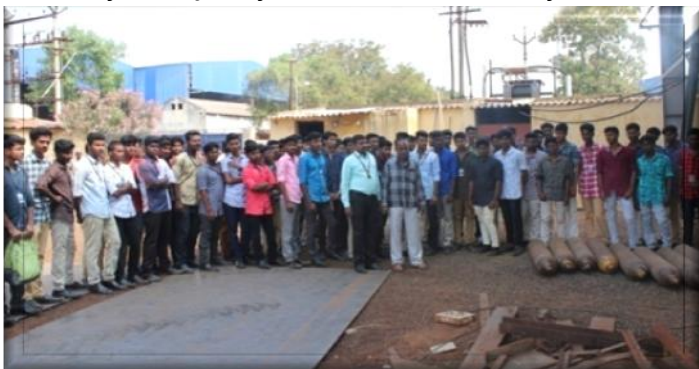
Second year students at the welding section of Sri Rajeswari Engineering Industries, Trichy.

Sixty seven students from II year Mechanical Engineering and two faculty members visited Sri Rajeswari Engineering Industries, Trichy, on 06 th February, 2019. Students gained experience in working environment and visited various departments like Auto welding, Finishing, Assembly and Quality control in the Industry.