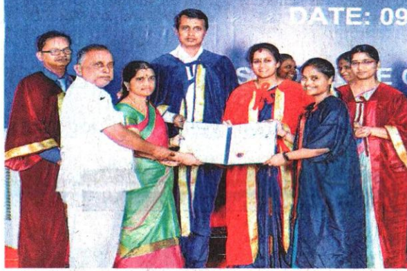
A candidate receiving degree from her parents during Graduation Day at Kings College of Engineering, Punalkulam. *