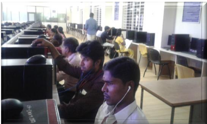
A view of the participants